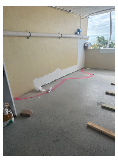
Garage Floor Void