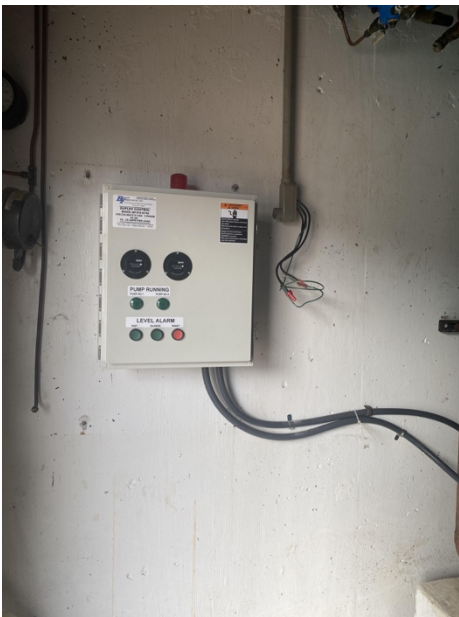
New Control Box for Water Pumps