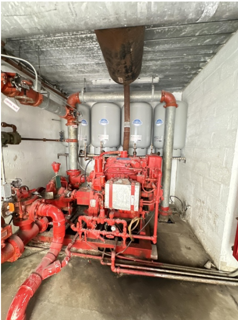
Fire Pump Room