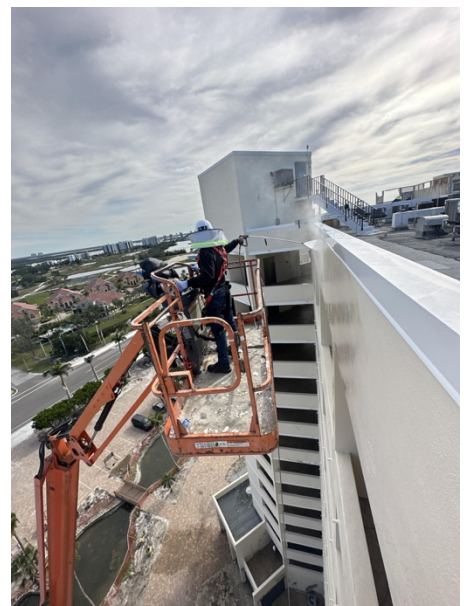
Exterior Power Wash