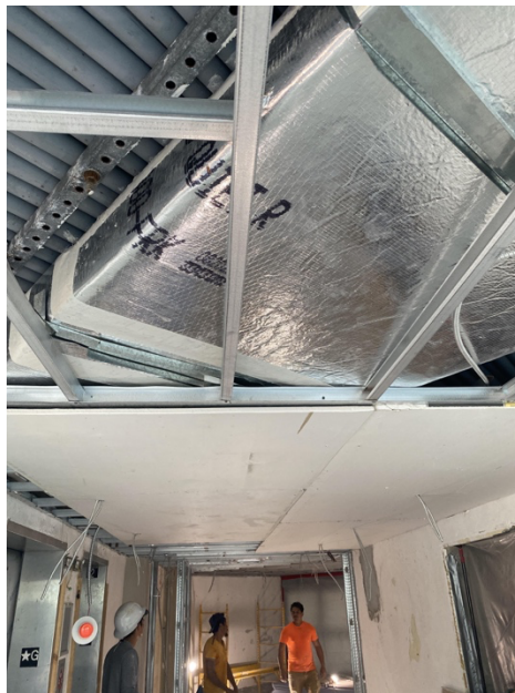
Drywall begins in lobby