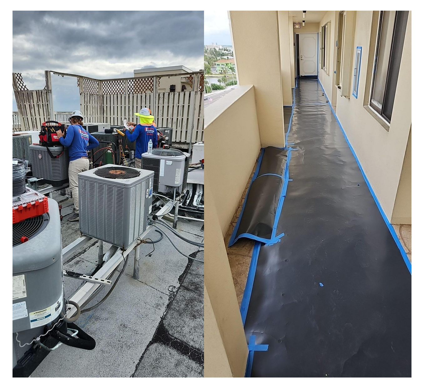
New Air Conditioner units being installed on roof