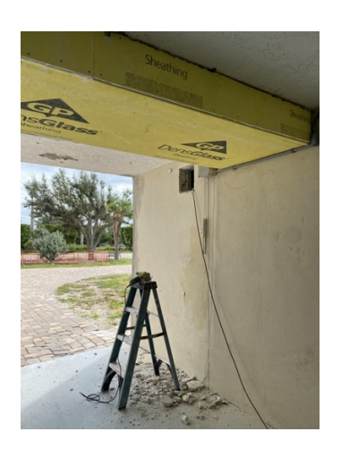
Piping Enclosures in Garage