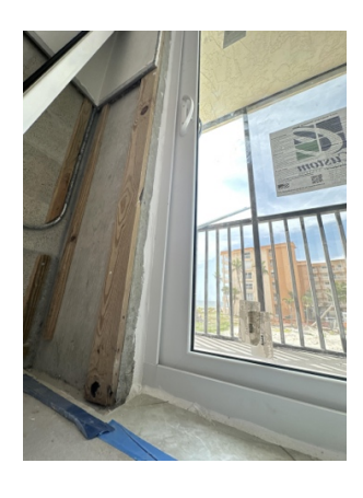
New 1<sup>st</sup> Floor Slider