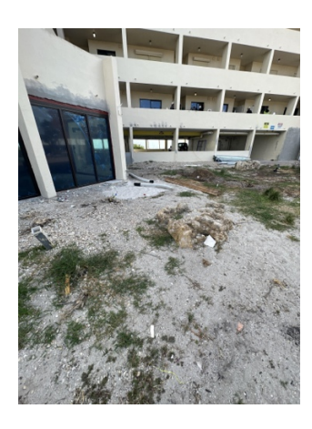
Front View Of Building