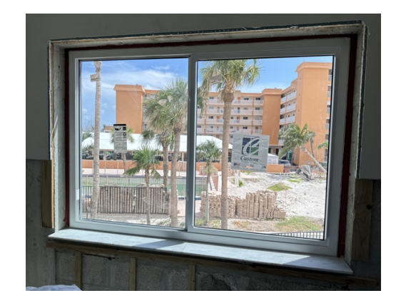
New First Floor Window