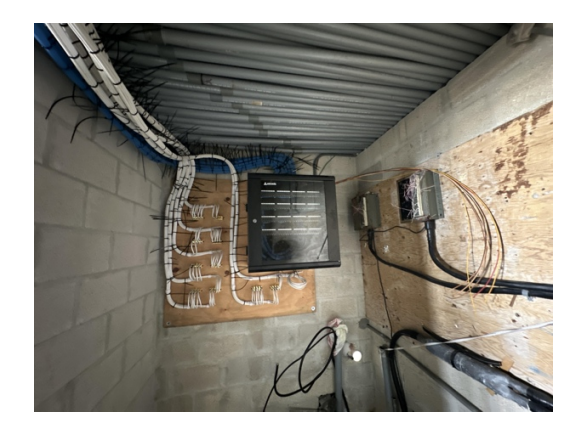
New Cat 5 Wiring