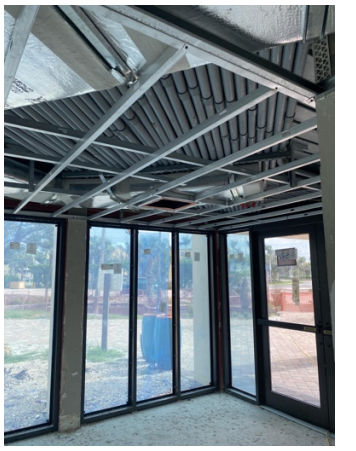
New Lobby Windows and Door