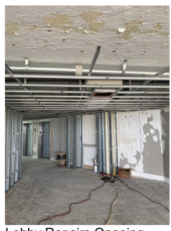
Lobby Repairs Ongoing