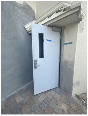
New Fire Door w/Window