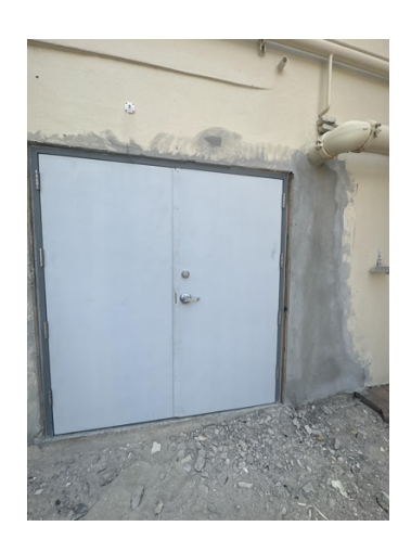
New Mechanical Room Door