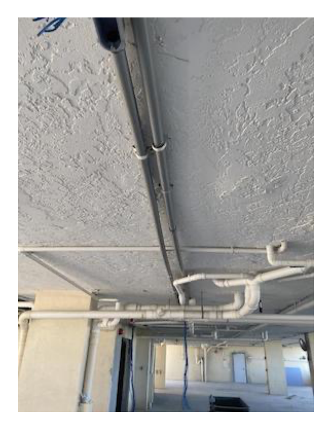
GARAGE CONDUIT CONSTRUCTION