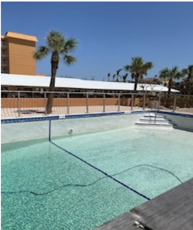
POOL CLEANED FILLED