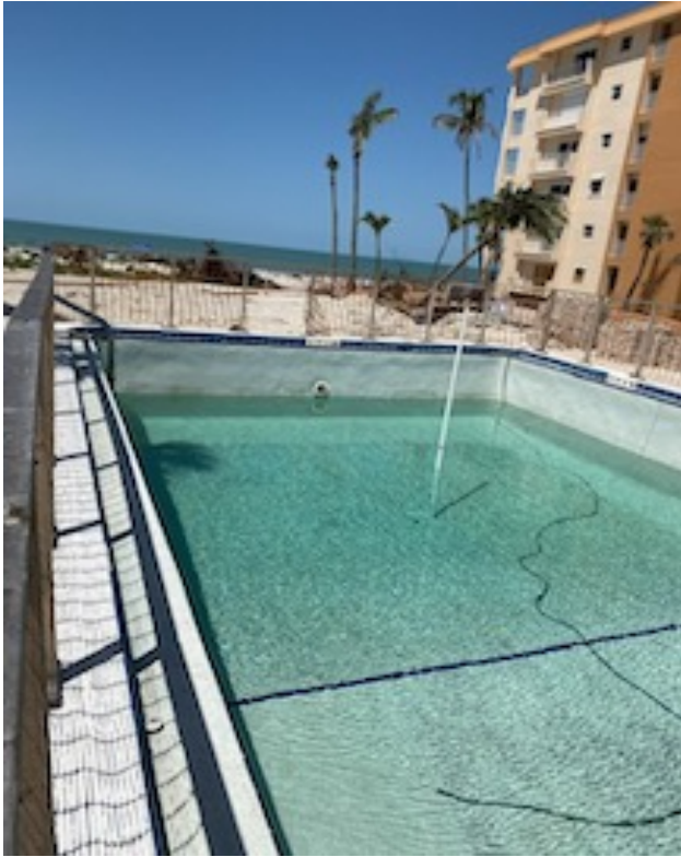
POOL GULF VIEW