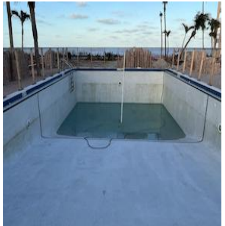
POOL CLEANED ETCHED