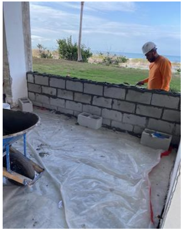
GULF SIDE GARAGE WALL