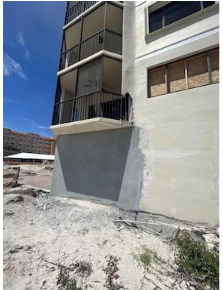
NORTH CORNER SIDE LANAI