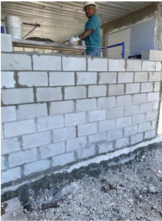
BLOCK WALL REPAIR