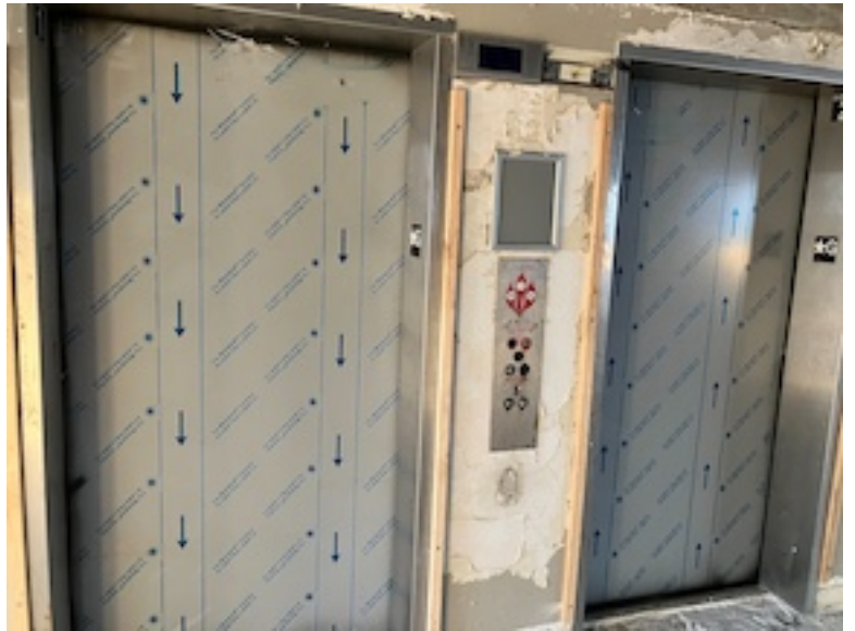
ELEVATOR DOORS INSTALLED