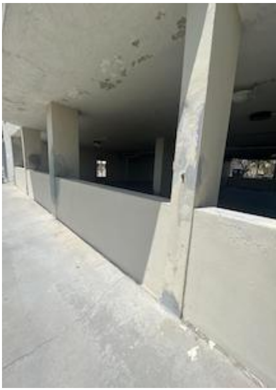
GULF SIDE GARAGE WALL