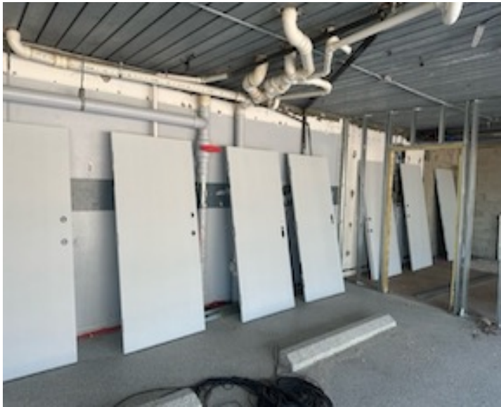
FIRE DOORS PREPPED FOR INSTALL