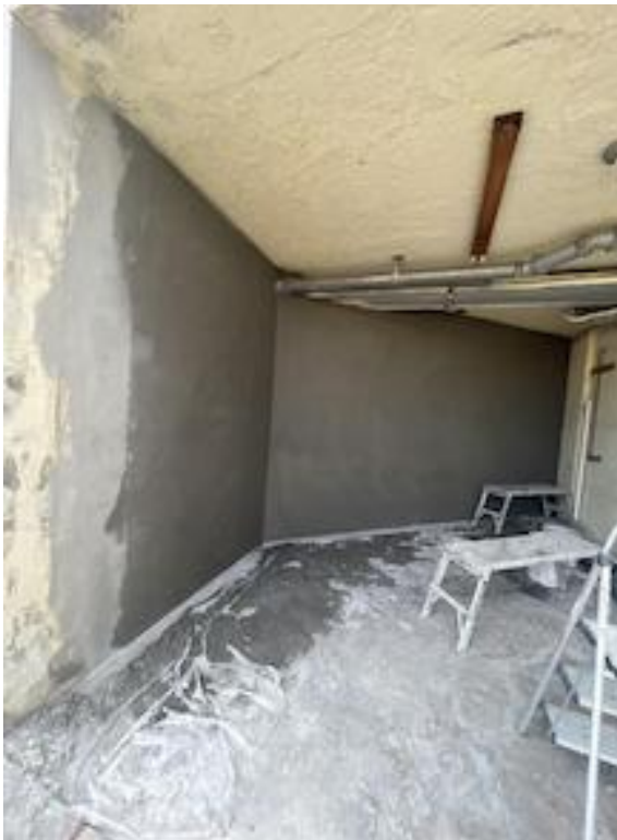
CART AREA INSIDE GARAGE