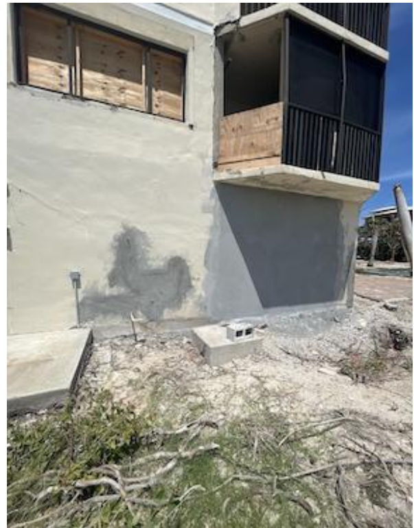
SOUTH CORNER LANAI